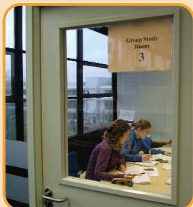
The recently opened Group Study Rooms on Floor Two are proving extremely popular; they can be booked through the Information Point on the Ground Floor.