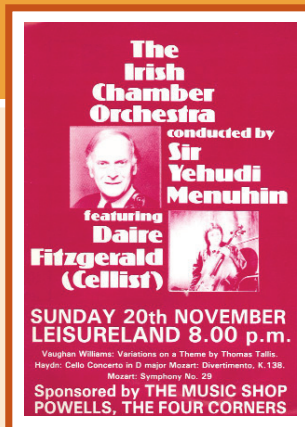
Music for Galway advertising Yehudi Menuhin's celebrated visit in 1983

This is a major addition to the Library's existing archival collections, of An Taibhdhearc, Druid, Galway Arts Festival and Macnas, which highlight the artistic and cultural life of Galway over the years.