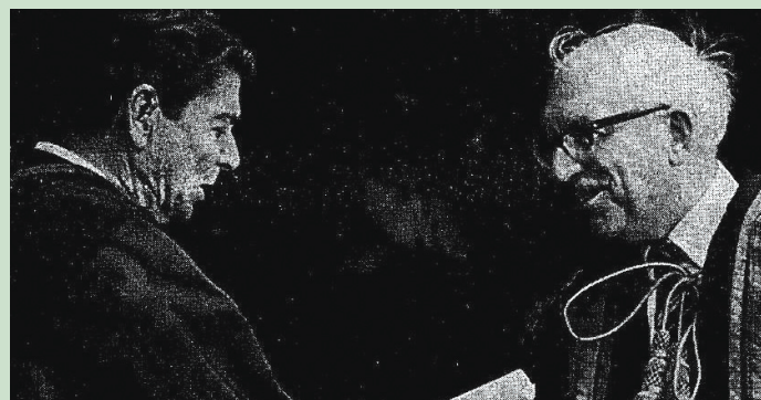
From the Irish Times Monday June 4th 1984, Dr. T.K. Whittaker, (former) Chancellor of the National University of Ireland, congratulates President Reagan after the conferring of an honorary degree by the University

The Archive is part of the imaginative "Changing Libraries" Initiative that will see further digitisation projects of national interest being made available. While the search functionality