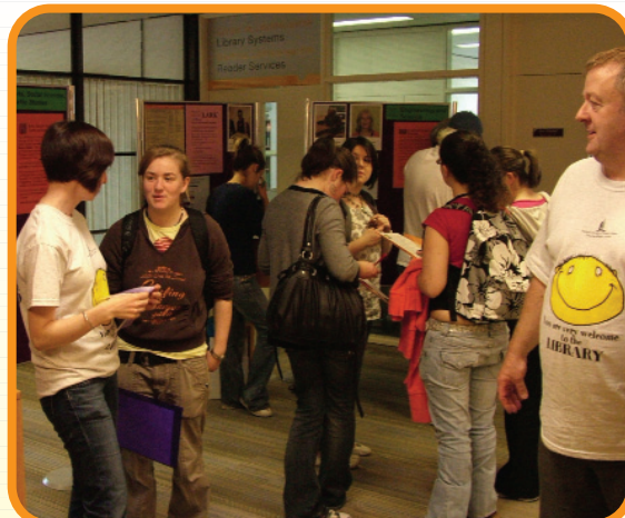
Students meet their Information Librarians during Orientation