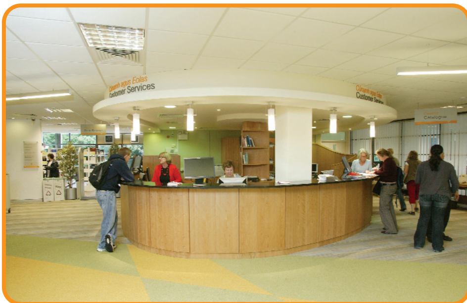
Early days at the new Customer Services Desk

As you enter the Library, you will notice that there have been some changes. The Library foyer underwent a major refurbishment over the Summer, with the introduction of a new Customer Services Desk and an office for information staff. Pods have been built to house the Library's self-check machines and catalogue terminals. A new carpet has been laid and new directional signs introduced.